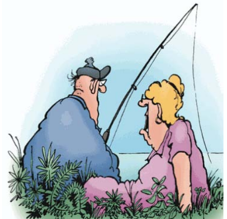
"I can't see any sense in this! We passed about ten fish markets on the way here."